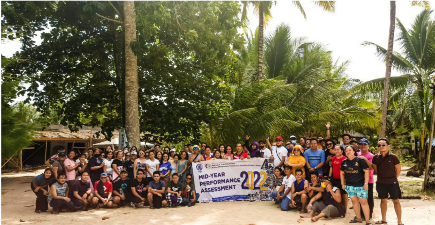
RTC-KorPhil Davao Conducts MYPA 2022 Cum Teambuilding