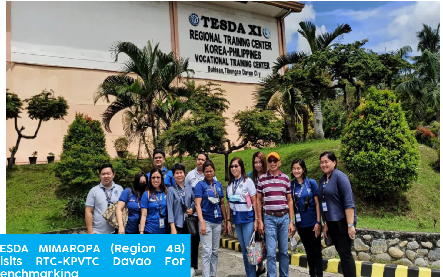
TESDA MIMAROPA (Region 4B) Visits RTC-KPVTC Davao For Benchmarking