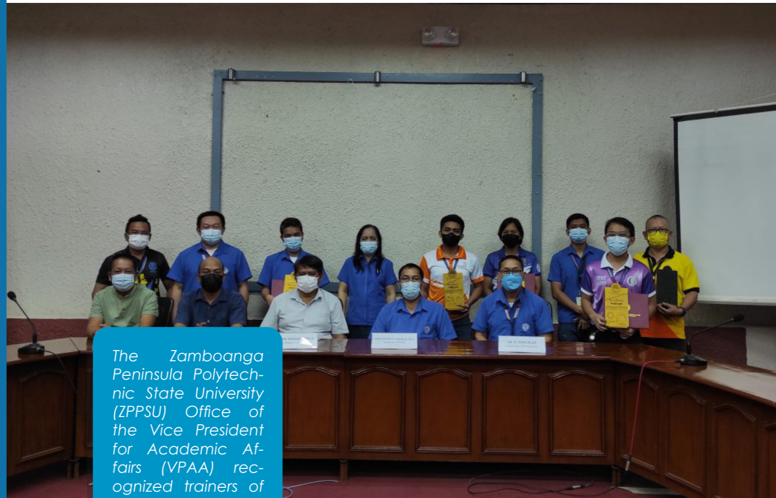
The Zamboanga Peninsula Polytechnic State University (ZPPSU) Office of the Vice President for Academic Affairs (VPAA) recognized trainers of RTC-KorPhil, Davao during their visit at the Training Center yesterday, July 13, 2022.